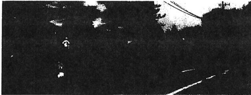
Calaveras Park Playground

The Honorable Stephan Sanders Presiding Judge of San Benito County Superior Court 450 Fourth Street Hollister, CA 95023